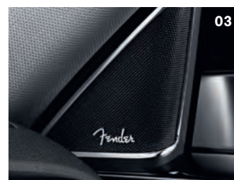
03 'Fender' premium soundpack.

When it comes to in-car entertainment systems, those looking to install a technologically advanced or upgraded system are spoiled for choice. Whether you require concert hall acoustics or the latest navigation system, these factory-fitted options provide state-of-the-art technology and connectivity. Choose the system that best meets your needs, then sit back and enjoy the benefits.