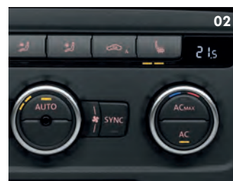
02 2Zone electronic climate control.

The importance of comfort and convenience cannot be over-emphasised. Choose from this range of factory-fitted options to create an interior that meets your individual needs, and makes life just that little bit more comfortable and convenient. From 2Zone electronic climate control to cruise control, from carpet mats to a Winter pack, these luxuries are designed to help you relax and take the stress out of driving, adding not only a touch of luxury, but also providing invaluable practical assistance.